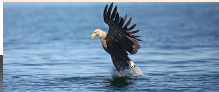
Eagles at Mountshannon